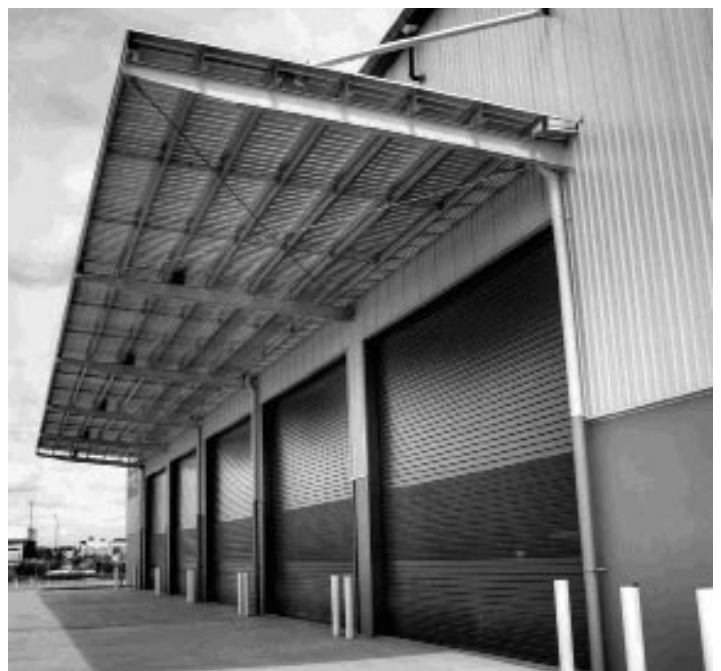
Lot 12, Eagle Farm QLD

Also in Germany, SMA Solar Technology operates from a carbon neutral factory in Kassel. The factory gains its electrical power from a massive building-integrated 1.1 MW PV system and an onsite biogas plant. In addition to being the world's largest solar inverter manufacturing site, the plant is also pioneering the concept of CO 2 neutral industrial production by utilising a low-energy building concept and renewable energy.