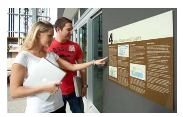
Bond University Mirvac School of Sustainable Development, Queensland

A green school provides a daily lesson in the importance of environmental sustainability to Australia's future; the building itself can be the best learning resource of all.