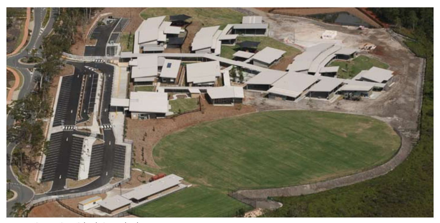
Peregian Springs State School, Queensland

Green Star certification for an education facility ensures that sustainability requirements are not compromised during construction. A formal commitment to Green Star demonstrates to school and university communities that sustainability remained a priority of the project.