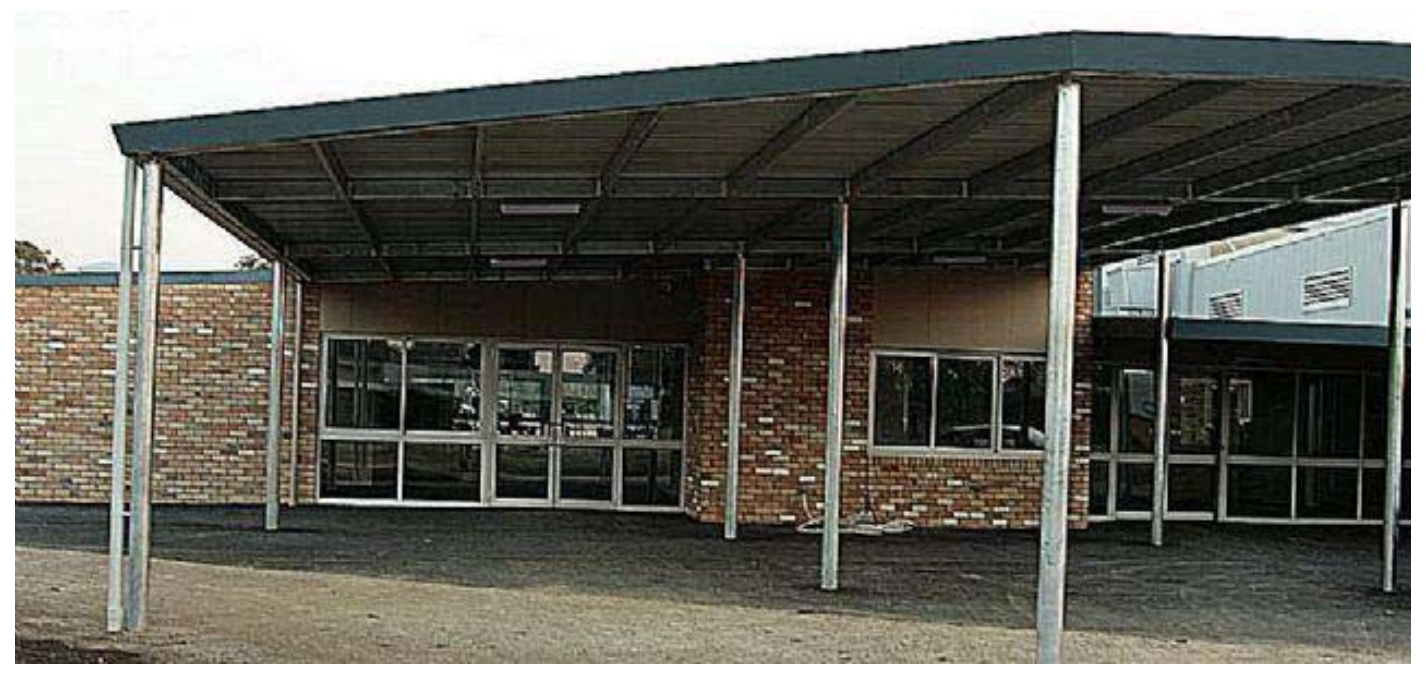
Wangaratta High School, Victoria

Green schools become an interactive learning resource that inspire and engage students with environmental issues. The new facility has inspired staff at Wangaratta High School to develop new learning programs so that staff and students can participate in the use, monitoring and ongoing improvement of the facility's environmental systems.