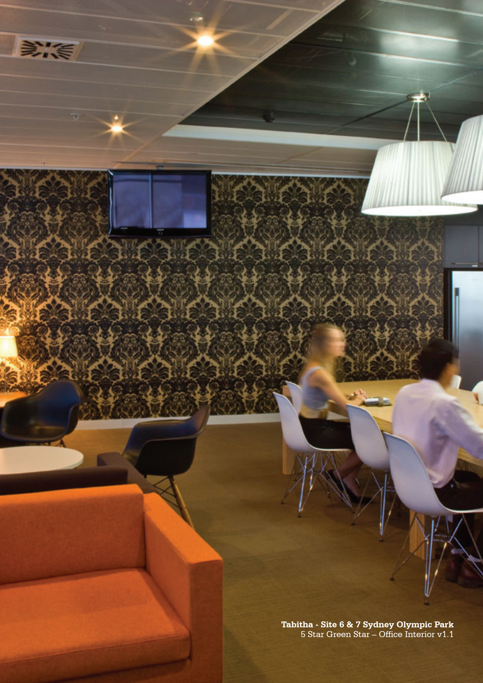
Tabitha - Site 6 & 7 Sydney Olympic Park 5 Star Green Star – Office Interior v1.1