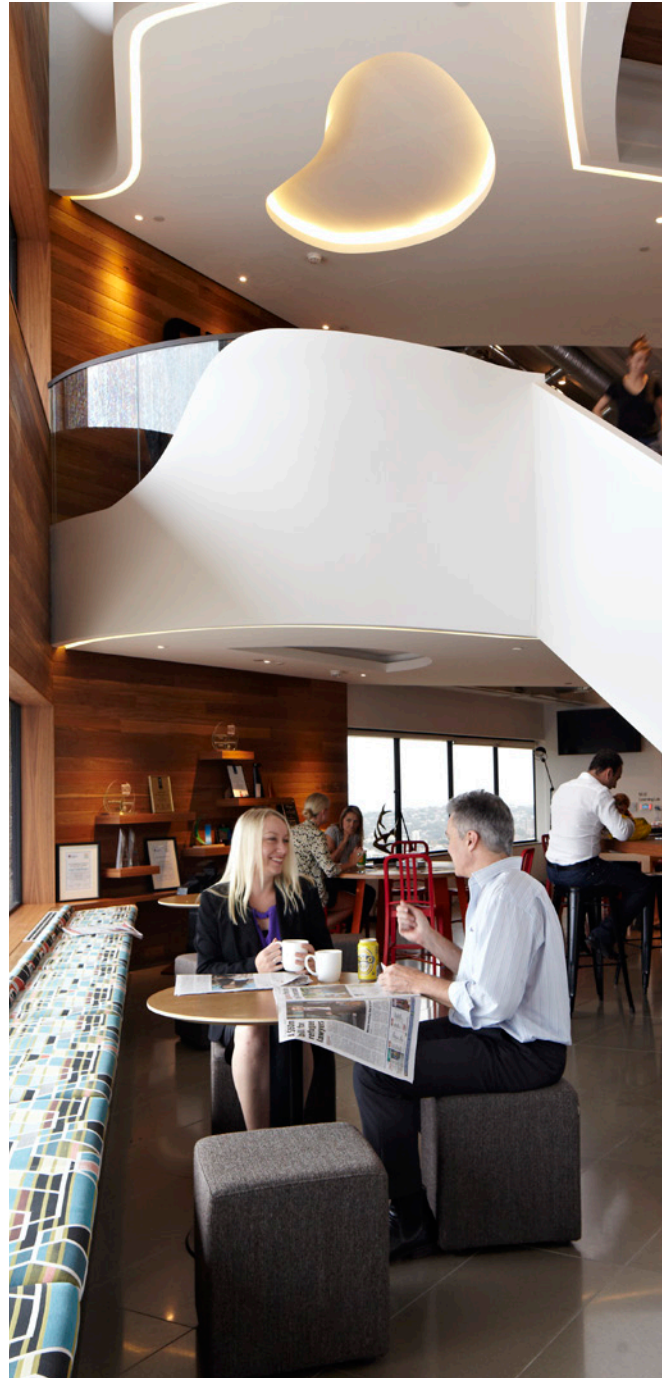
GPT Office Fitout

www.gbca.org.au/education-courses/green-star-qualifications