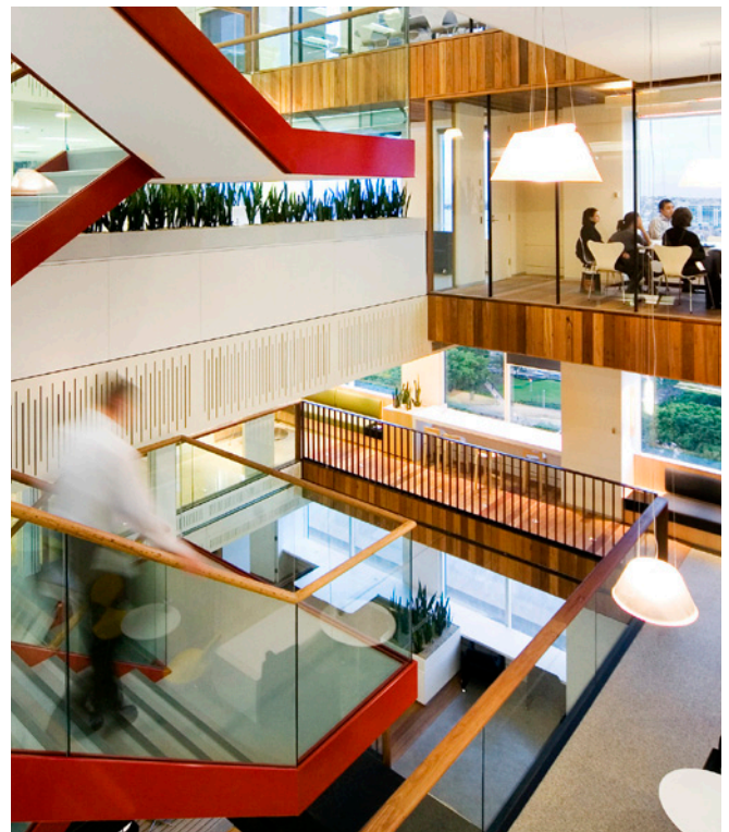
Stockland Head Office Stockhome 6 Star Green Star – Office Interiors v1.1