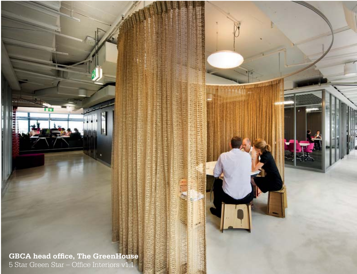
GBCA head office, The GreenHouse 5 Star Green Star – Office Interiors v1.1

If you're a CPD participant, now is the time to ensure you have enough points to maintain your CPD status. Remember, you need 15 CPD points to maintain Green Star Associate status and 30 CPD points to maintain Green Star Accredited Professional status. The first renewal period ends on 30 June 2012.