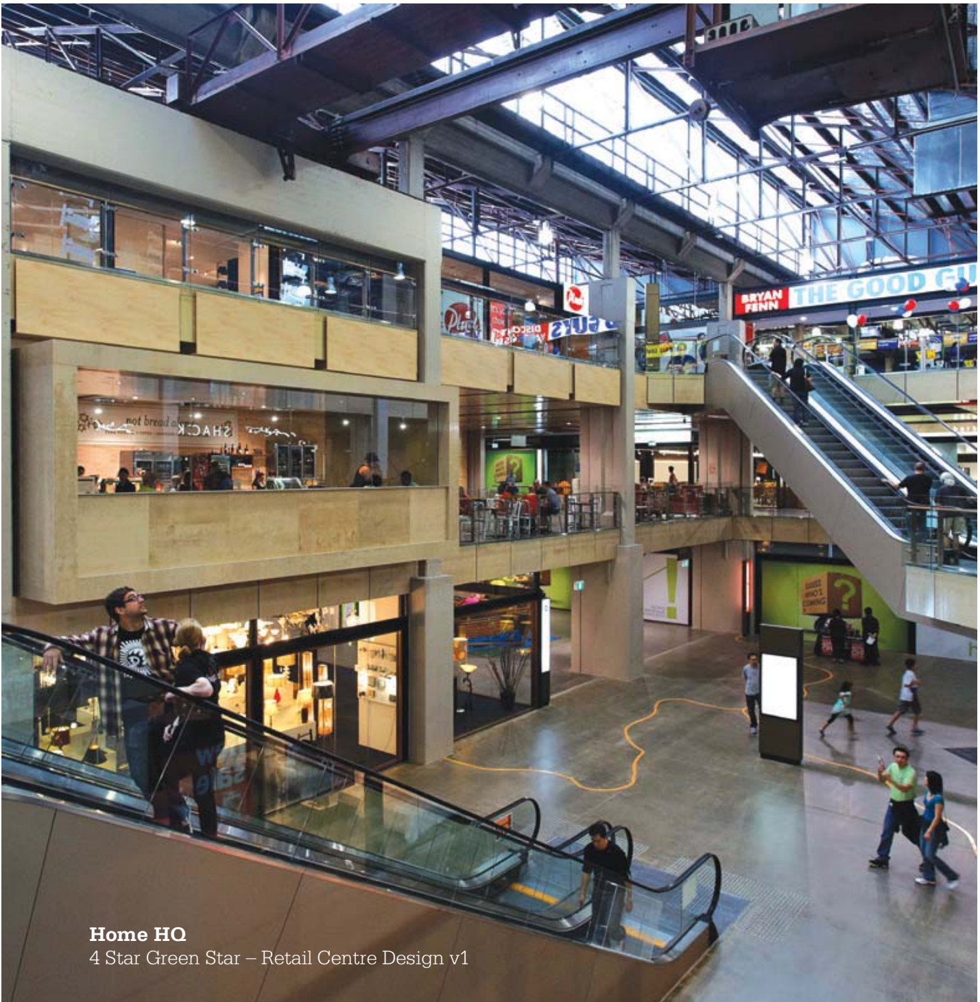
Home HO 4 Star Green Star – Retail Centre Design v1