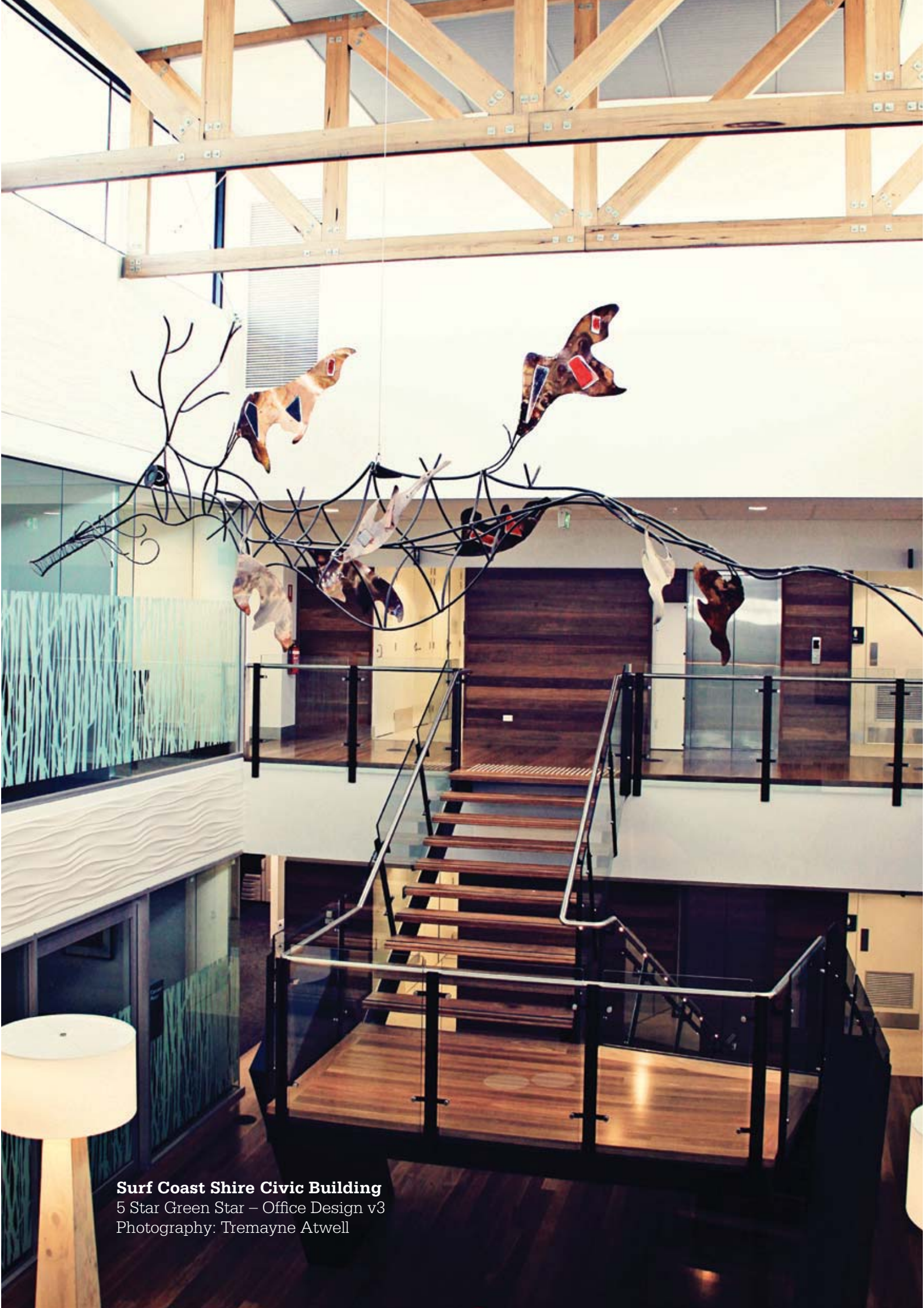
Surf Coast Shire Civic Building 5 Star Green Star – Office Design v3