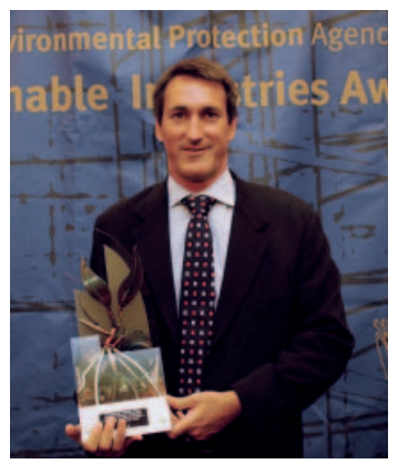
Sustainability in Urban Development or the Built Environment Award winner: Mirvac