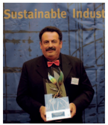
Sustainable Technologies Award winner: Poly Optics Australia Pty Ltd