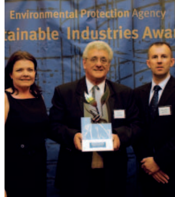
Public Sector or Community Initiatives Award winner: City of Thuringowa